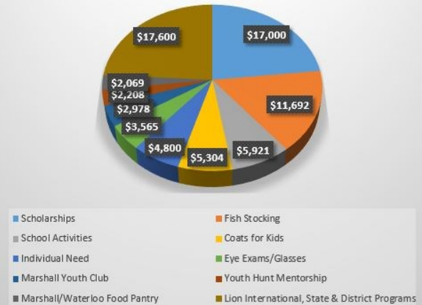
Marshall Lions Club Charitable Donations Over $95k from 2011-2016!

We thank you and the community thanks your for your support!